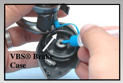
Clean and oil VBS® Brake Case and spool bearing. A clean and oiled brake case will ensure quiet casting performance.