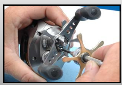
Use a small Phillips or flathead screwdriver to remove handle assembly.

Lightly rinse reels with freshwater using a spray bottle. Avoid excessive water from a high pressure source as this may push salt and/or debris inside the reel. Wipe down reel with a rag or towel after rinsing. This is also good practice after every fishing trip.