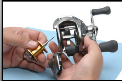
Remove spool assembly. Clean any visible dirt and debris from exterior of reel with cotton swabs or toothbrush and isopropyl rubbing alcohol. Dirt, debris, salt or sand leads to wear and tear.