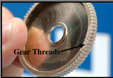
Clean drive gear and apply Shimano® Drag Grease on the threads of the gear.