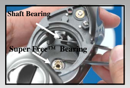
Lightly oil Super Free<sup>TM</sup> support bearing and drive shaft bearing.