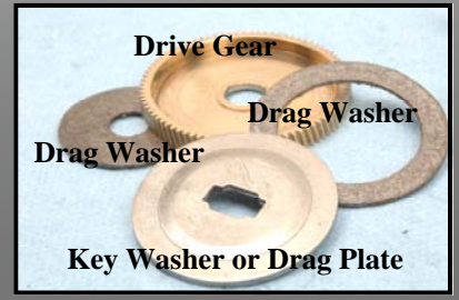
Drive gear, drag spacer, drag washer and drag plate.