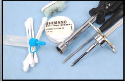
Tools and cleaning materials recommended to service reel. Some Shimano® reels come with Bantam<sup>TM</sup> Oil. These simple tools are readily available at hardware stores.

Lubricants: Shimano® Bantam<sup>TM</sup> Oil (BNT1445), Shimano® Drag Grease (A-DRA1/4) Cleaners: Cotton Swabs, Isopropyl Rubbing Alcohol, Tooth Brush, Paper Towels or Rags Schematics: All Shimano® reels come with schematics, however, they can also be found here: http://fish.shimano.com/publish/content/fish/sac/us/en/customer_service/reel_schematics.html